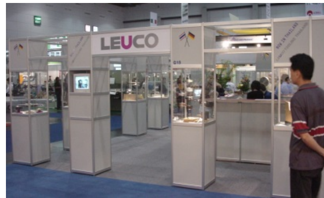
Exhibition in Thailand 2001

LEUCO Singapore cordially invites you to the WoodmacAsia 2001.